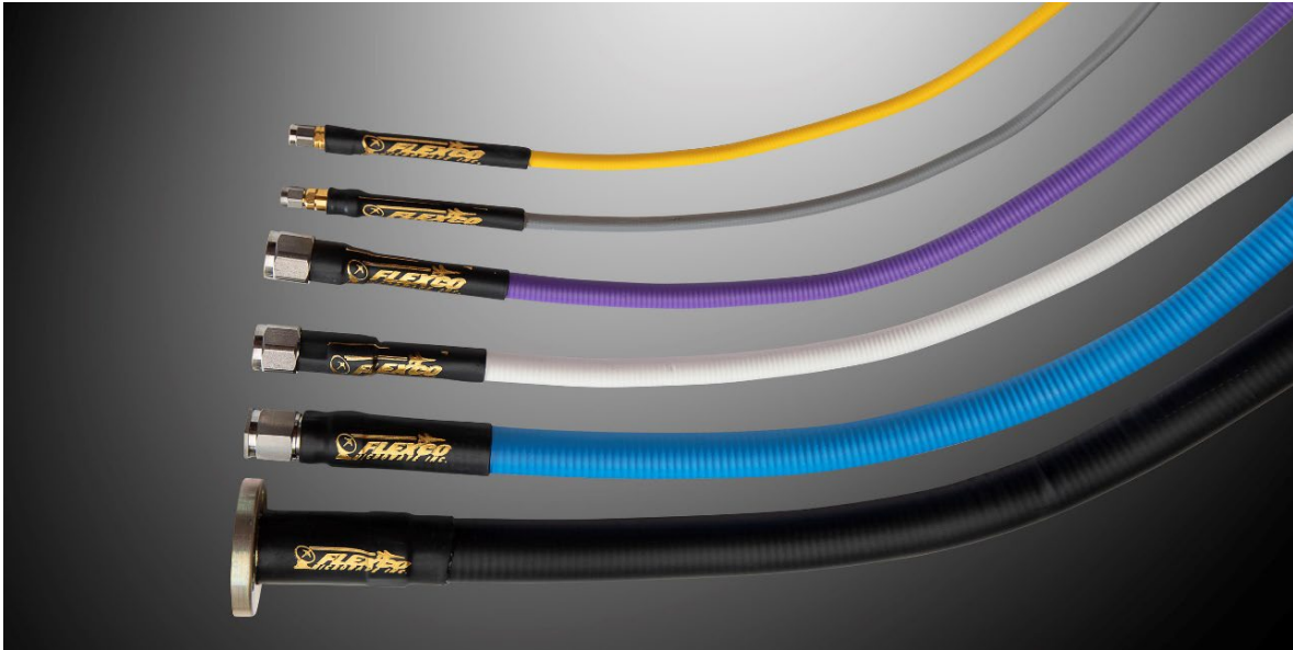
Figure 1. flexible cables can prolong system lifetime by allowing for repeated use and long-term durability without damage or performance degradation.

Flexible coaxial (coax) cables are used in several applications such as ground-based electronic warfare systems, phased array radar systems, air surveillance systems, test and measurement in laboratory or harsh environments, antennas/base stations, 5G and telecom applications, SATCOM and space environment testing, to name a few. These flexible cables can prolong the life of these systems since they allow for repeated use and long-term durability without damage or deterioration of performance. Not all flexible coax cables are equal, however; there are problems with industry-standard flexible coax cables but Flexco, a pioneer in the development and manufacturing of flexible coax cables, has successfully addressed the inherent cable problems with their patented technology.